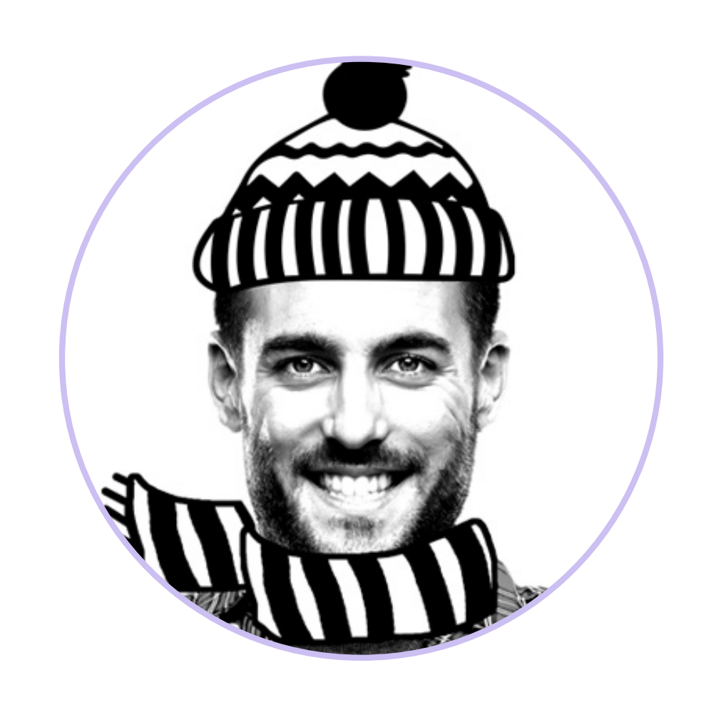
On the Ripple Maker